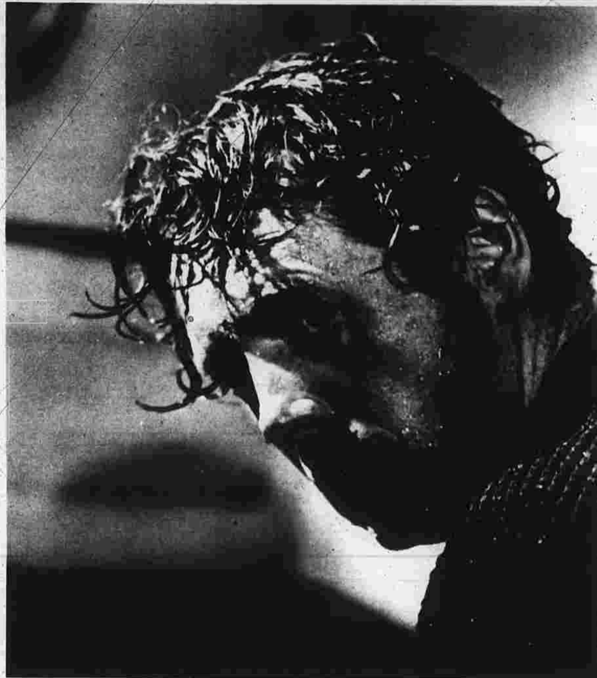
Patrick McGeehan escapes by raft from captivity in CBS' "The Prisoner" Thursday 8 to 9 p.m.

Studies also have shown, that the average TV set was in use 6 hours and 28 minutes daily during heavy viewing months through 1968, but dropped in the July-September period to five hours and 10 minutes.