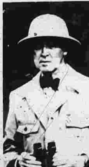
James Stewart on NBC's "The Dean Martin Show" Thursday 10-11 p.m.

Rubenstein himself narrates the program. "Arthur Rubenstein," filmed at many locations including Israel, Iran, France, Spain and the United States.