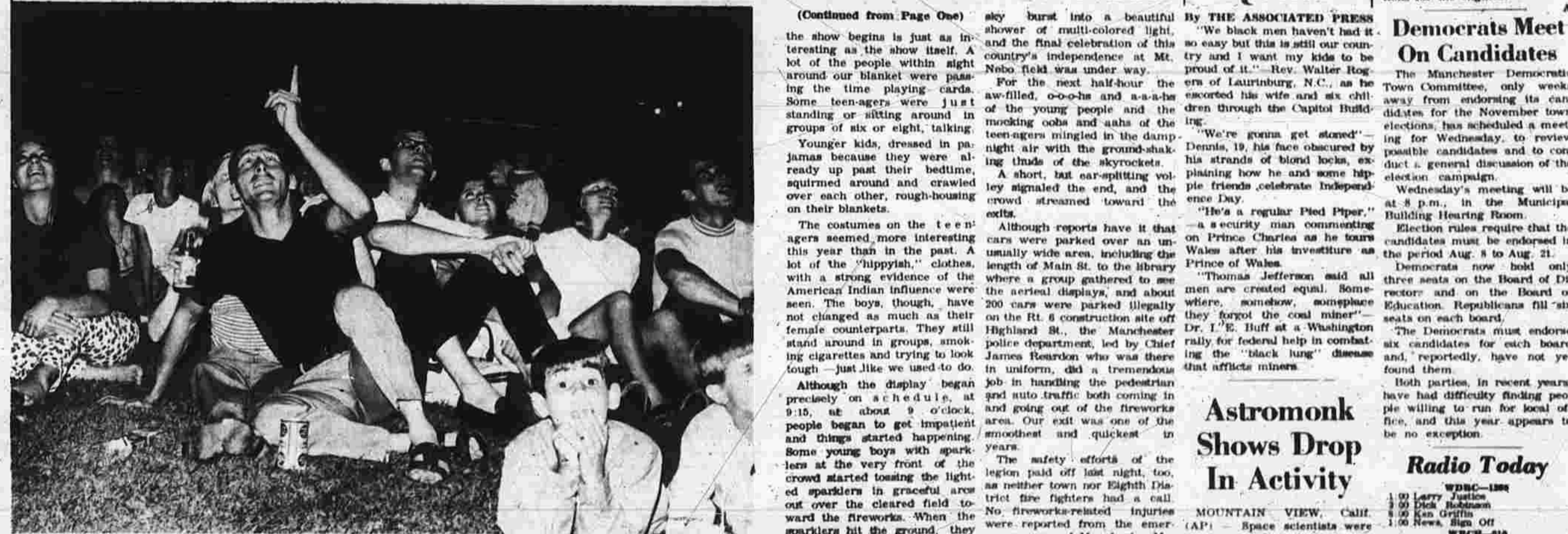
People react in many ways to exploding bombs at a fireworks show, and some of them were captured last night at Mt. Nebo in the photo below. Notice that in this crowd, not one single person has his fingers in his ears. In the top photo, Herald photographer Al Buevievics took a double exposure to record this fascinating scene, a ground piece engulfed in a bursting aerial bomb display.