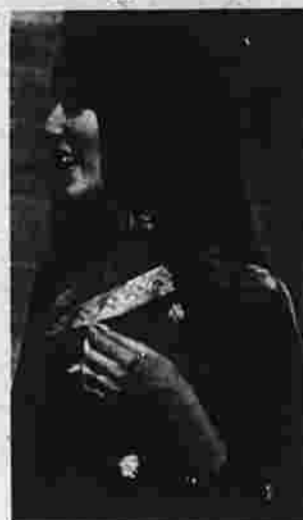
Bette Davis stars in the film, "Dead Ringer," Thursday 9-11 p.m. on CBS.