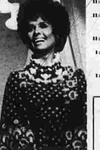
Lena Horne on NBC's 'Kraft Music Hall from London' Wednesday 9-10 p.m.