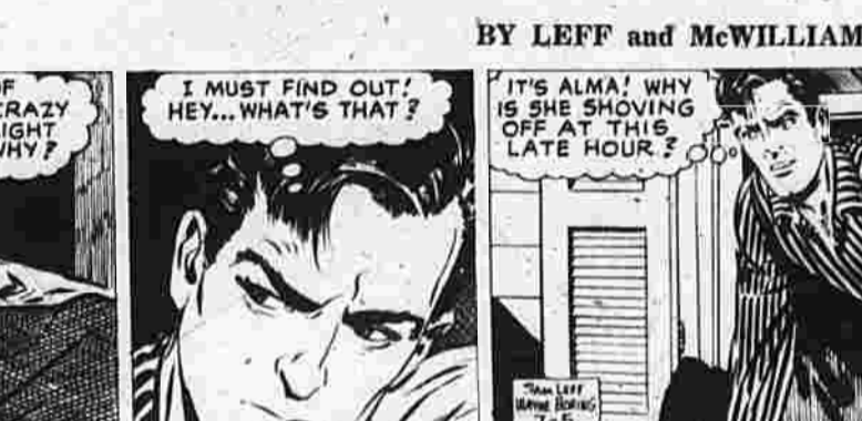
BY LEFF and McWILLIAMS