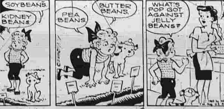
BY AL VERMEER