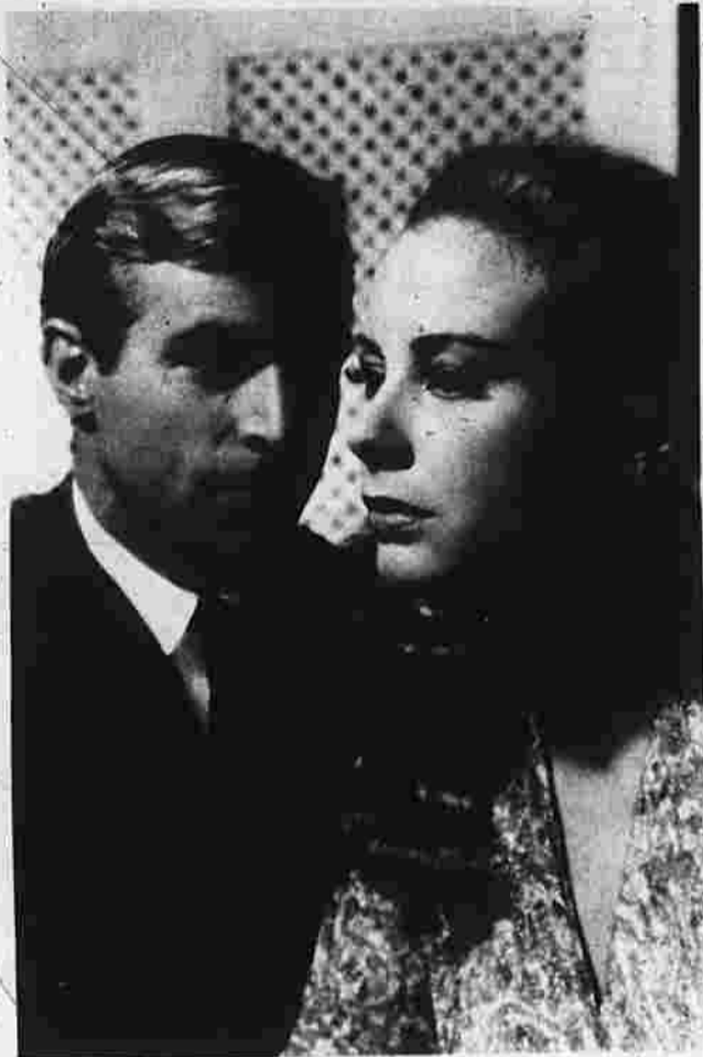
James Franciscus in love with Genevieve Page in film, "Youngblood Hawke," Friday 9 p.m. on CBS.