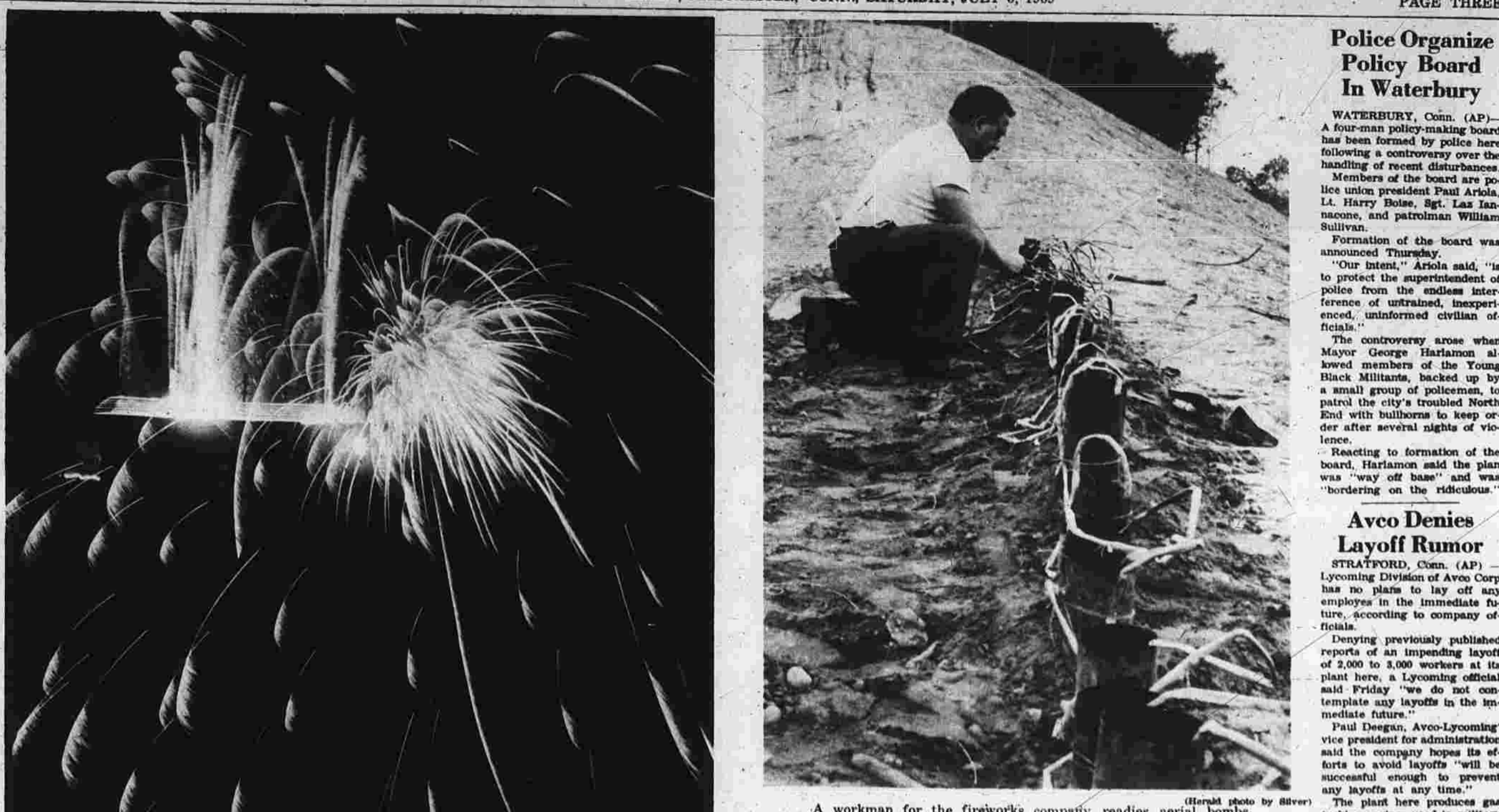
People react in many ways to exploding bombs at a fireworks show, and some of them were captured last night at Mt. Nebo in the photo below. Notice that in this crowd, not one single person has his fingers in his ears. In the top photo, Herald photographer Al Buevievics took a double exposure to record this fascinating scene, a ground piece engulfed in a bursting aerial bomb display.