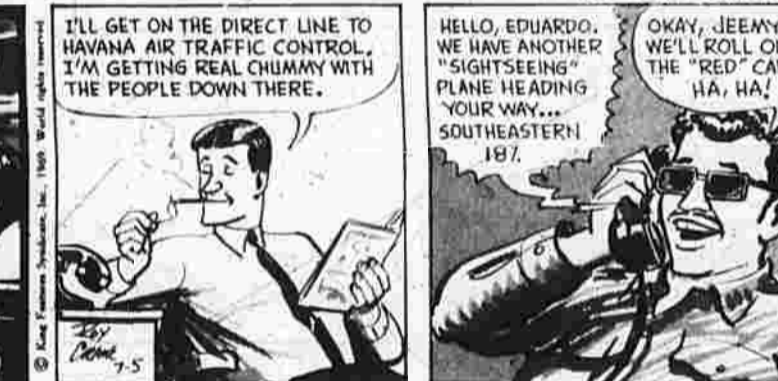
BY ROY CRANE