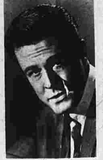
Robert Culp narrates 'Operation Breadbasket' Monday 7:30-8:30 p.m. on ABC.