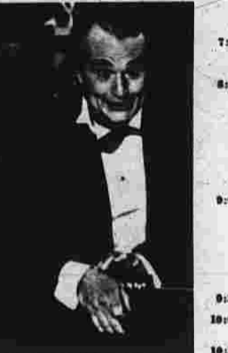
Red Skelton on the autoharp on CBS' 'The Red Skelton Hour' Tuesday 8:30 - 9:30 p.m.