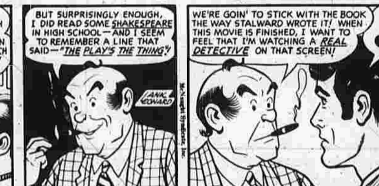
BY LANK LEONARD